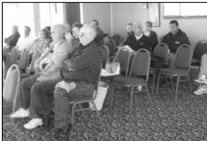
CONDUCTING BUSINESS - A fair-sized crowd turned out for the spring board meeting of the VARLCA, held April 17 in Fredericksburg.

I have also been very busy with grievances this quarter. I have had two pay issues both appealed up to Step 2; a letter of warning, which was settled; working more than 12 hours in one tour of duty, which was also settled; failure to follow instructions (settled); 7-day suspension, reduced to a letter of warning with six months in the file; route change and edit book problems (settled); and a letter of warning on unscheduled absence, which was appealed up to Step 2.